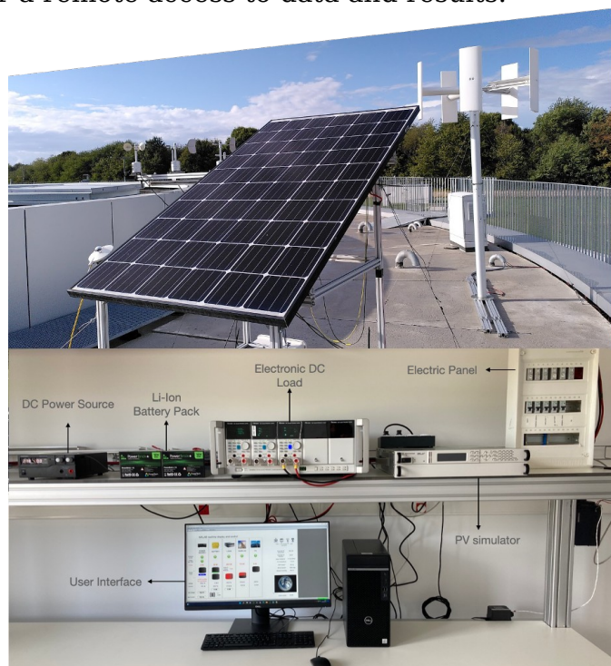
Figure 1: NRLAB views

The development of smart grids is expected to come from the aggregation of basic low voltage power supply networks, known as microgrids, which associate local energy production with storage capacities and energy consumers. Microgrids restricted to a single building are often called "nanogrids" and are also getting attention as the building block of a microgrid. Such nanogrids are vulnerable to both sudden changes of power generation and load demand because of their small size, especially when operating in an island mode. Thus, managing uncertainty becomes essential when searching for an optimal nanogrid operation.